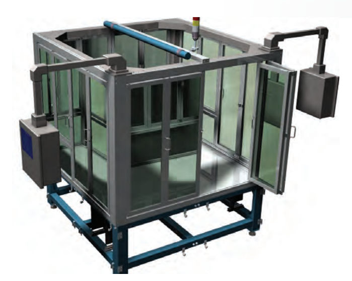
Putting together structures using Creo Advanced Framework Extension eliminates fit up errors, saves valuable engineering time, and reduces, and reduces the cost of development.

An integral part of the Creo product family, Creo AFX provides designers and engineers with a means to dramatically improve the accuracy and productivity of defining structural framework assemblies. Because this module is native to Creo, you can quickly and easily share this intelligent 3D model throughout all phases of the project–design, detailing, analysis, fabrication, and final assembly. Now you can achieve faster structural framework definition and meet or beat even the most aggressive project deadlines. Add Creo AFX to your cache of design tools and dramatically reduce the time to create accurate structures, frames, or assembly lines compared to 2D CAD and traditional 3D CAD solid modeling methods.